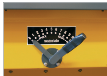
Dosing scale for adjustment of spreading quantity.