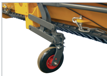
Adjustable support wheel for off-loading - easy to mount/dis-mount on truck.

Data collection: It is possible to install the Epolink data collection box for transfer of spreading data to Vinterman Light.