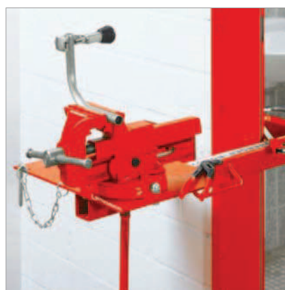
Parallel Vice (No. 70705X) and rotatable table not included