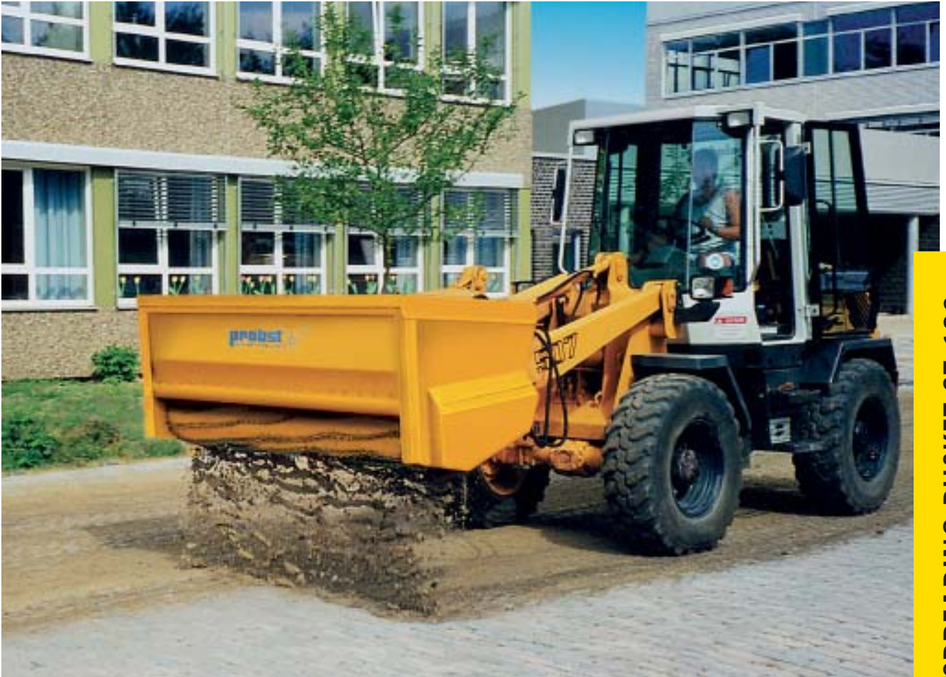
SPREADING BUCKET ST 180