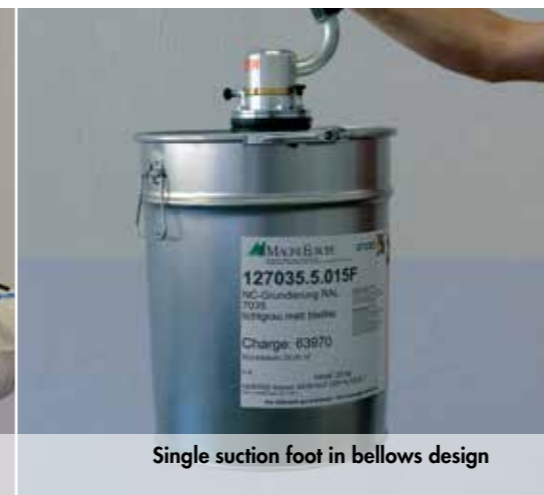
Single suction foot in bellows design