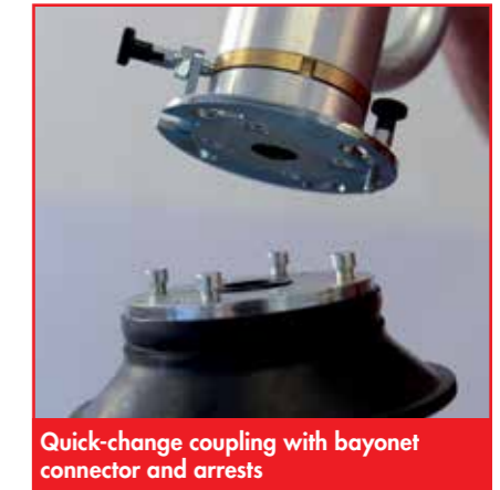
Quick-change coupling with bayonet connector and arrests