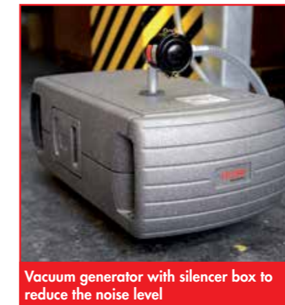
Vacuum generator with silencer box to reduce the noise level