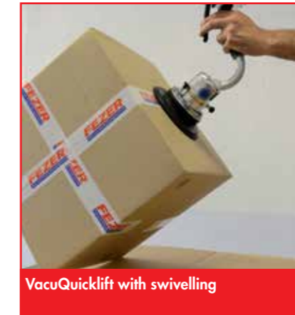
VacuQuicklift with swivelling