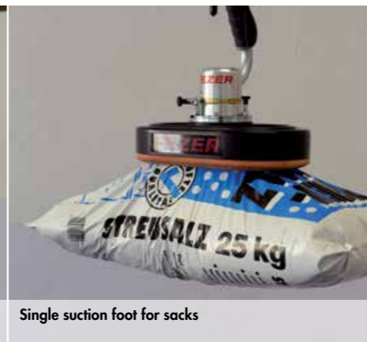
Single suction foot for sacks