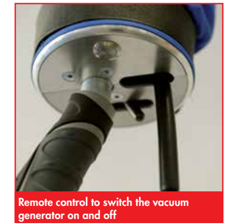
Remote control to switch the vacuum generator on and off