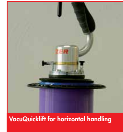
VacuQuicklift for horizontal handling