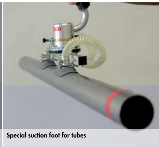
Special suction foot for tubes