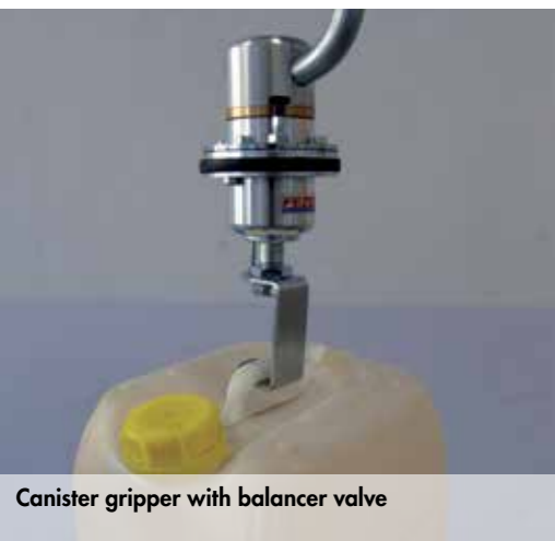
Canister gripper with balancer valve