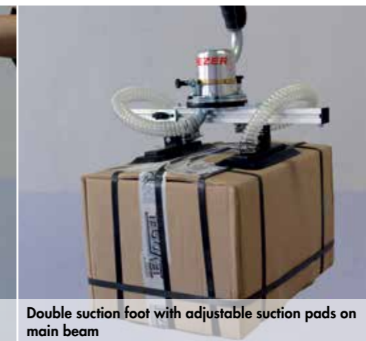
Double suction foot with adjustable suction pads on main beam