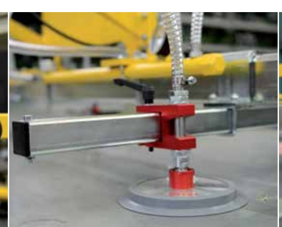
Suction pads with cross clamping piece to adjust on the cross beam