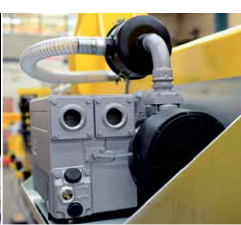
Powerful, robust and low-maintenance pumps for highest safety