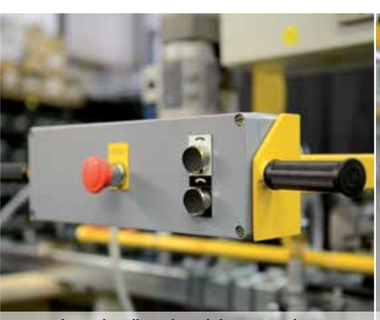
Manipulating handle with push-buttons and emergency-off on lifters with electrical movements