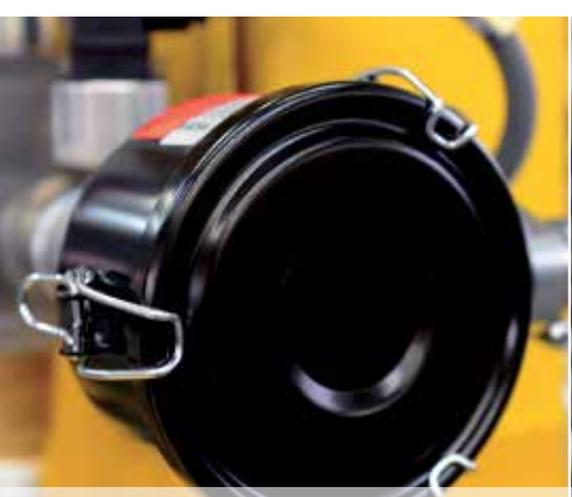
Large-dimensioned dust filter with exchangeable filter cartridge