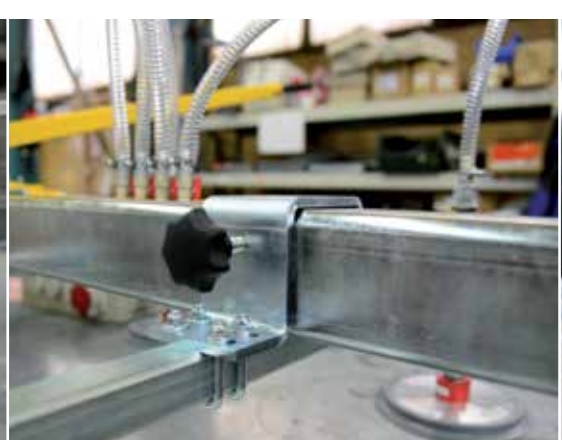
Mounting element with clamping screw to adjust the cross beam