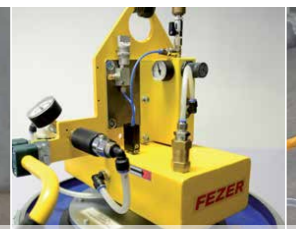
Air Pack: strictly running on compressed air via ejector and pneumatical warning unit