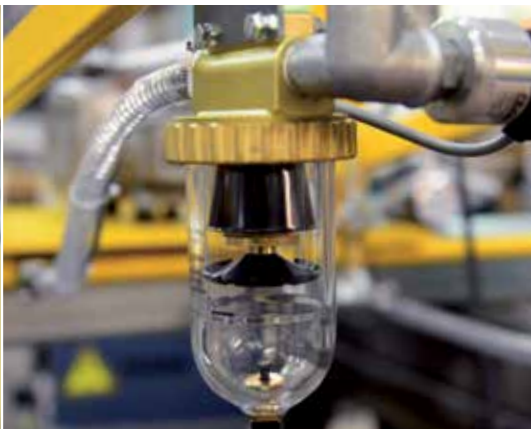
Water separator with manual drain for outdoors use or on water jet machines