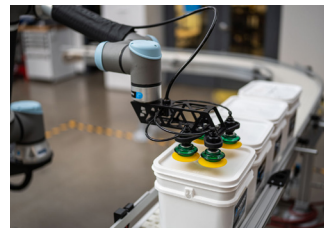
200 mm offset for even greater reach, particularly useful for smaller and lighter cases

100 mm offset for maximum payload and a greater reach