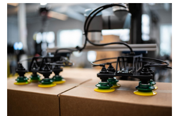
Possibility of dual gripper for multipick applications