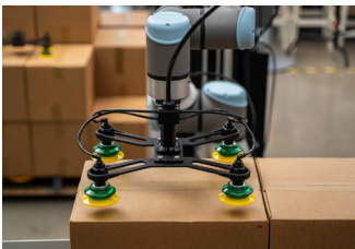
Large suction cup bracket for adapting to larger cases

0 mm offset for maximum payload and fastest rotation, especially useful for big cases