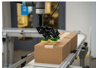
Wrist extension for vertical offset to handle smaller cases

0 mm offset for maximum payload and fastest rotation, especially useful for big cases