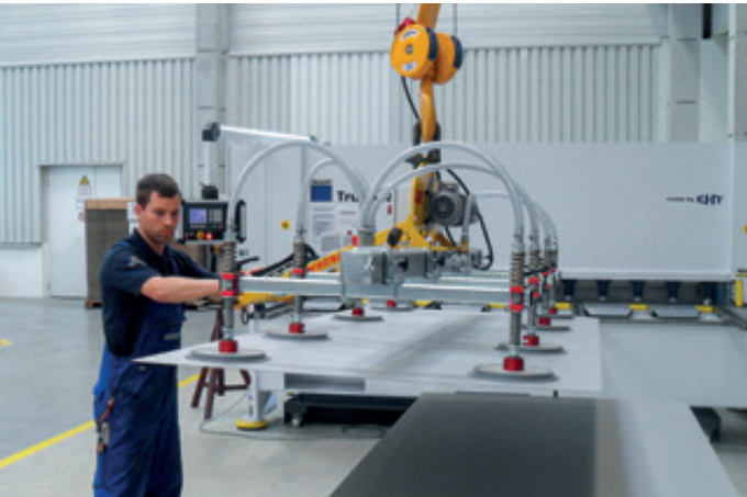
VacuBoy VB-750KG Handling of large format sheets