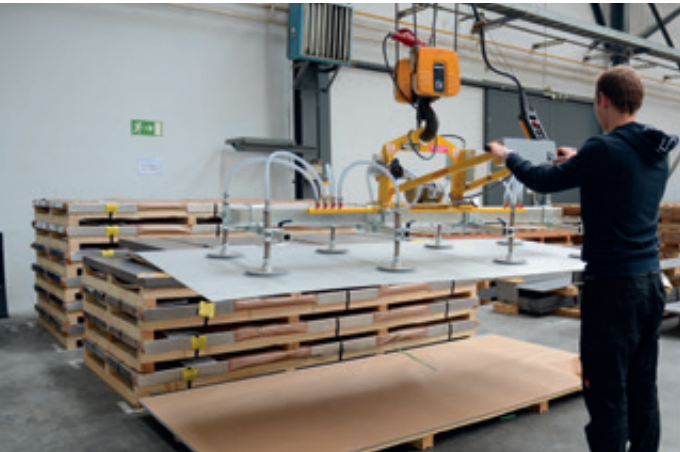
VacuBoy VB-1000KG Order picking of steel sheets