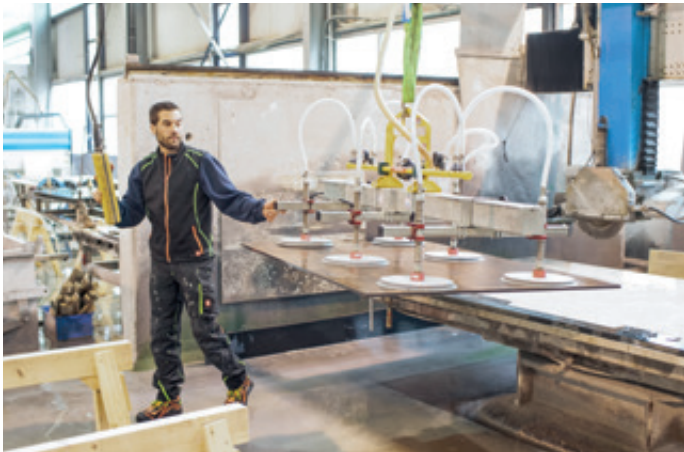
VacuBoy VB-250KG Handling of wet stone slabs