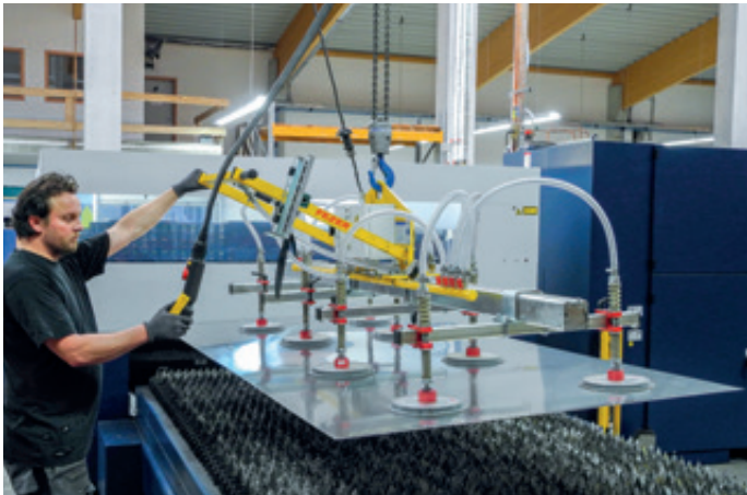
VacuBoy VB-500KG For loading a CNC machine