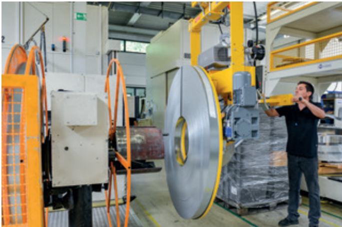
VacuCoil VC-90E-1000KG For aluminum coils up to 1,800 mm in diameter