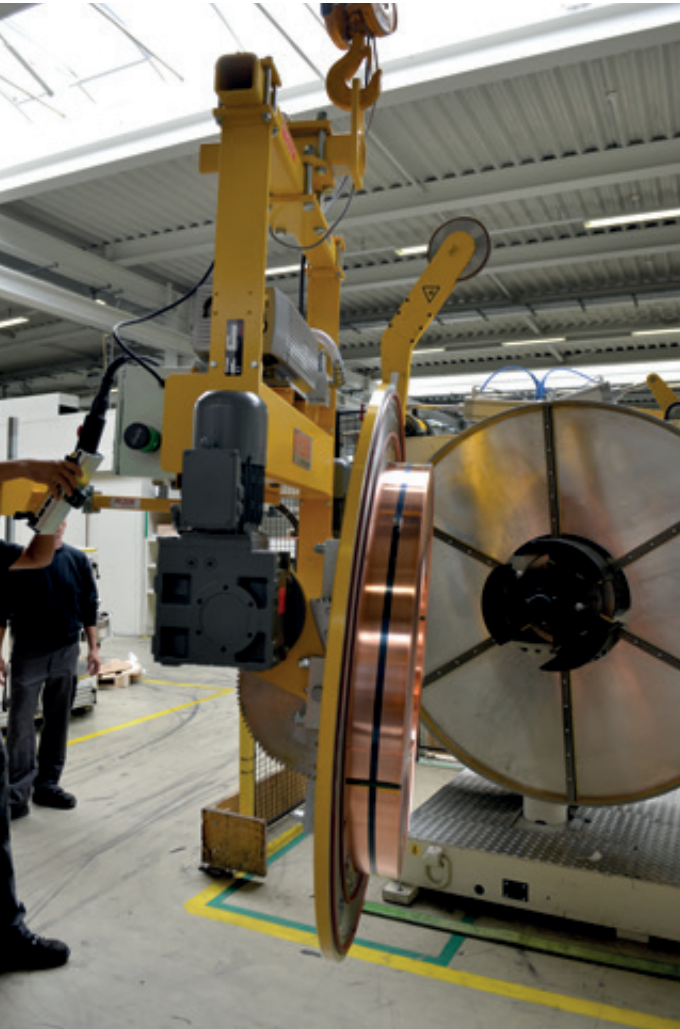
VacuCoil VC-90E-1250KG For fitting a coiler mandrel with copper coils