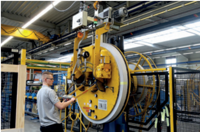
VacuCoil VC-90E-800KG For plastic coils in the production of roller shutter components