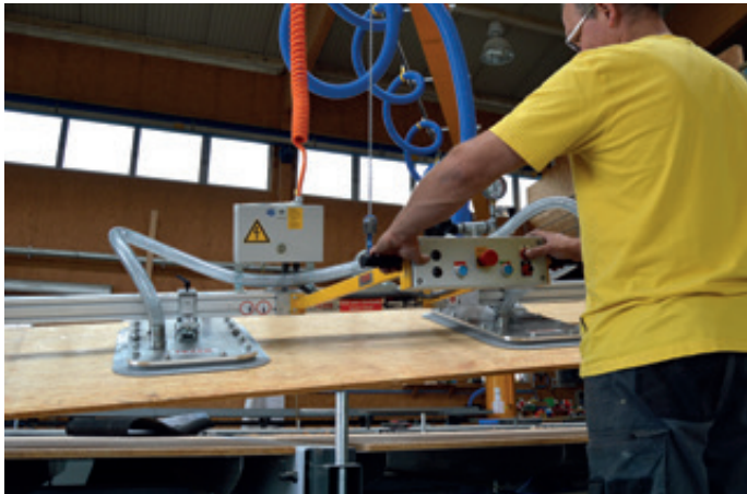
VacuPoro VP-500KG With integrated crane control for moving MDF and OSB boards