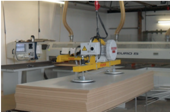
VacuPoro VP-250KG For handling raw and coated chipboard