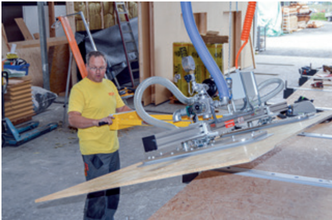
VacuPoro VP-500KG With separately installed blower for OSB panels