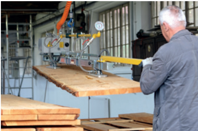
VacuWood VW-250KG With special suction pads for rough-sawn surfaces