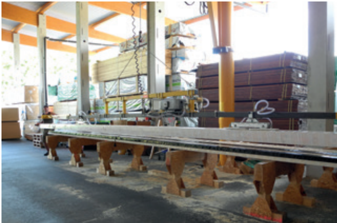
VacuWood VWLB-250KG For shifting logs up to 12,000 mm long