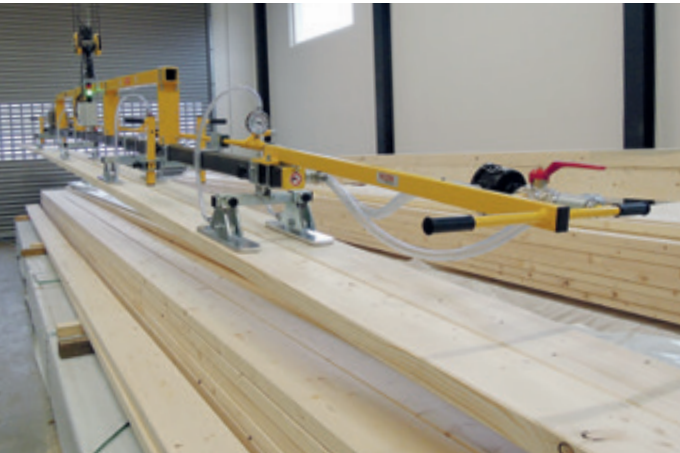
VacuWood VWLB-500 with double suction cups, simultaneous lifting of double-layer wood with a length of up to 12,000 mm possible