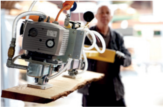
VacuWood VW-250KG For stacking wooden planks after a dividing saw.