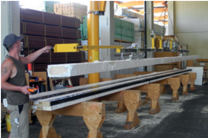
VacuWood VWLB-250 For laminated beams wrapped in film up to a length of 14,000 mm