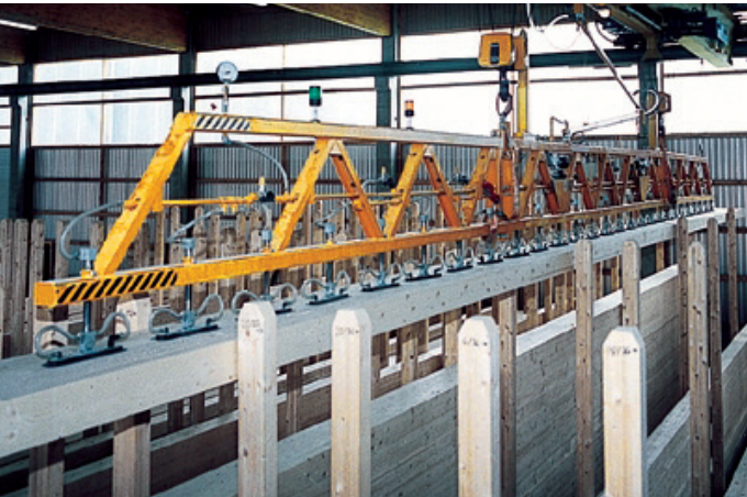
VacuWood VWLB-750KG For order picking of 16,000 mm long pieces of wood in a stanchion store