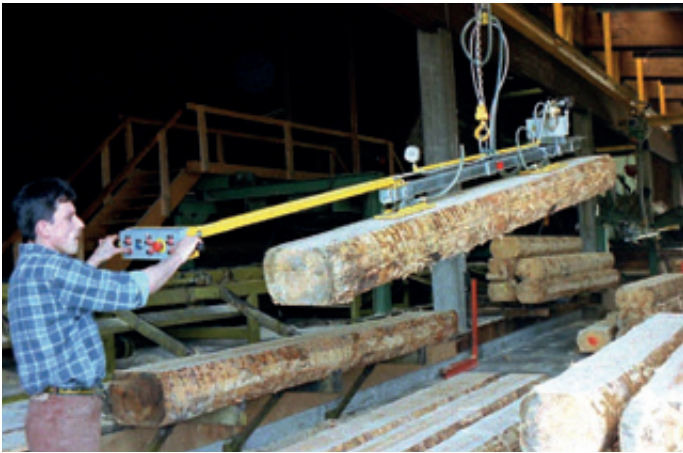
VacuWood VW-500KG For feeding logs to a lattice saw.