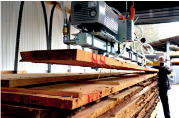
VacuWood VW-250KG For transporting lumber up to 6,000 mm